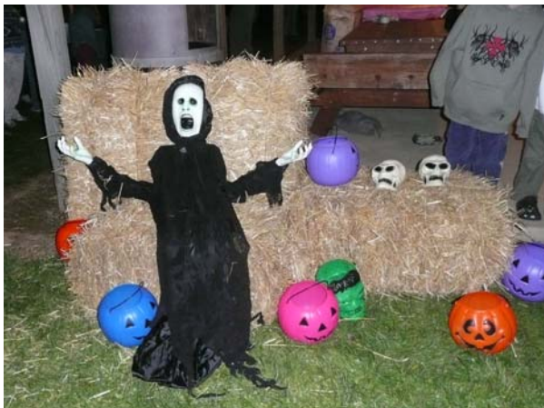
Our Haunted Halloween Trail was a "scream". If you weren't there this year, make plans for next. You can scare or be scared. Either way, it's a howling good time. To be part of the fun call 355-1419.

Thank you for all of your patience and consideration as we worked to complete this project.