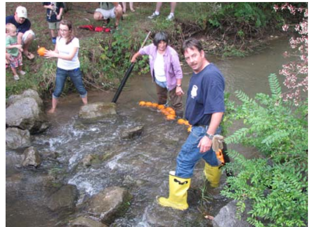
Float your . . . Nope, it's not a boat it's a pumpkin. The pumpkin float was just one of the fun activities that took place during our annual Fall Festival and Pumpkin Celebration. Join us next year— September 12th.